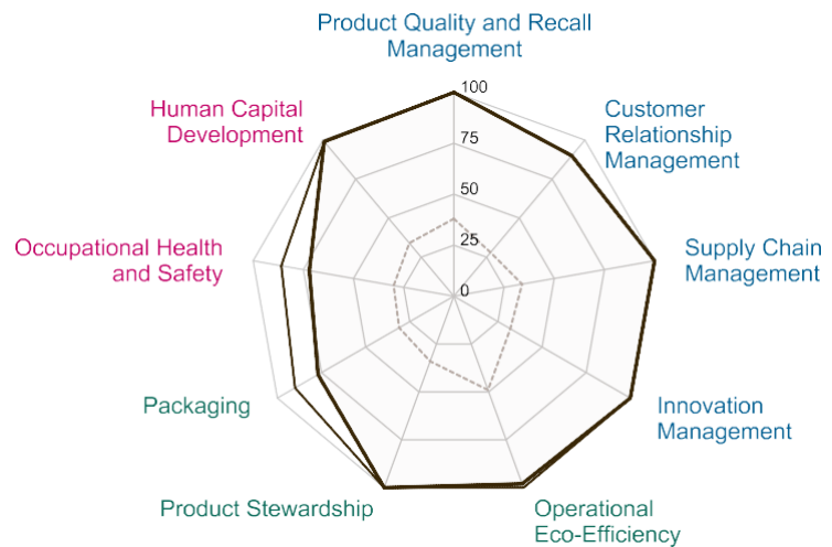
— Industry Best Score - - - - Industry Average Score ■ Company

S&P Global has selected the most relevant criteria in each sustainability dimension based on their weight in the assessment and their current or expected significance for the industry. The spider chart below visualizes the performance of the industry leader against the best score achieved in each criterion and the average industry score.