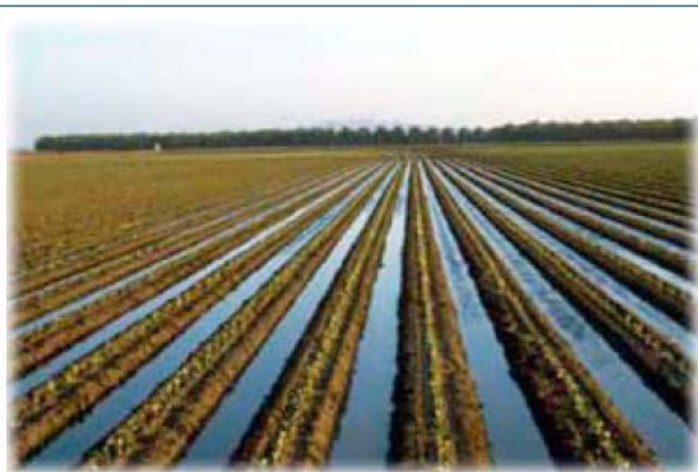
University of Arizona.

In border irrigation, the field to be irrigated is divided into strips (also called borders or borderstrips) by parallel dykes or border ridges. The water is released from the field ditch onto the border through gate structures called outlets.